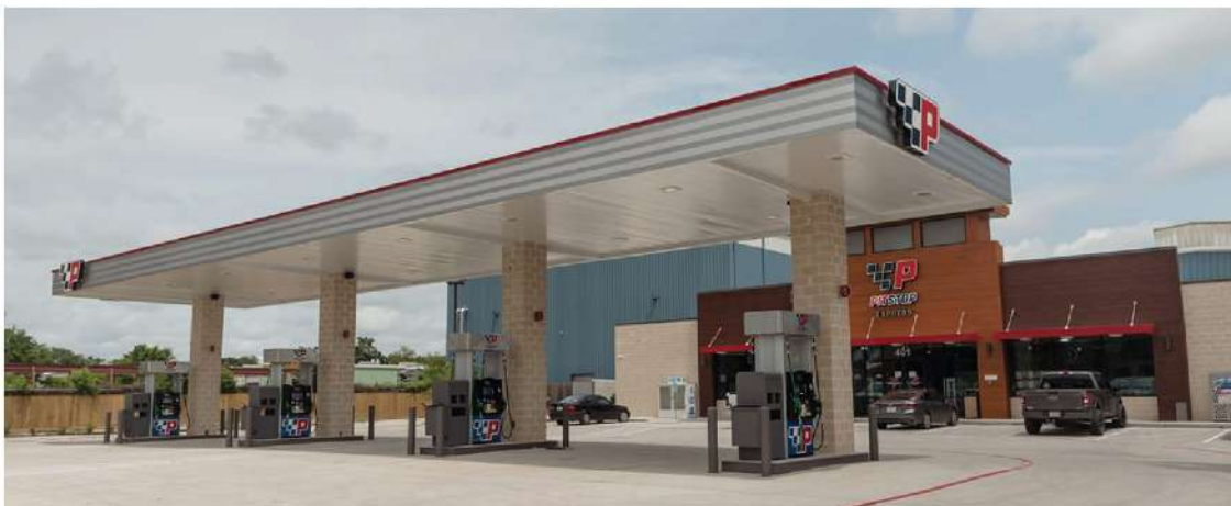
Facade Exterior Remodel Friendswood TX 2022