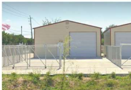
Ground up | Warehouse | Houston, TX General Contractor | 6000 sf June 2020 - Dec 2020