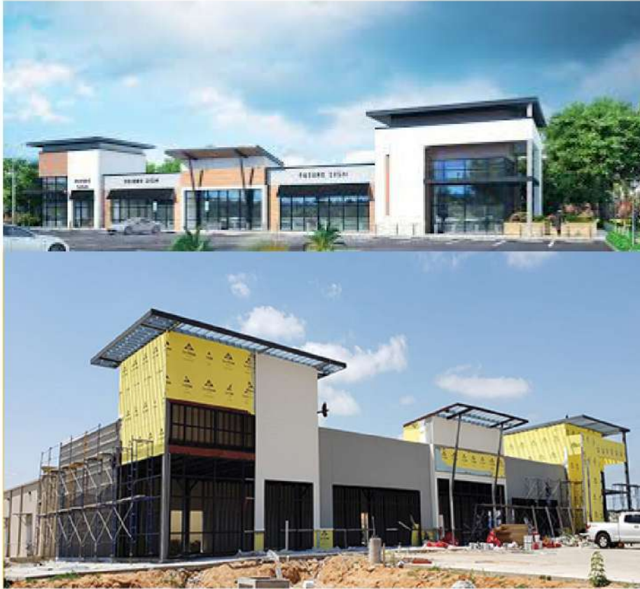
GROUND UP | RETAIL STRIP CENTER | SEALY, TX GENERAL CONTRACTOR | 8040 SF APR 2022- DEC2022