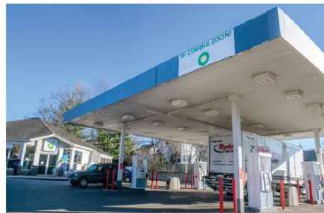
Exterior & Interior Extensive Remodel Gas Station | Batson, TX | 3000 sf Jan 2022 - Mar 2022