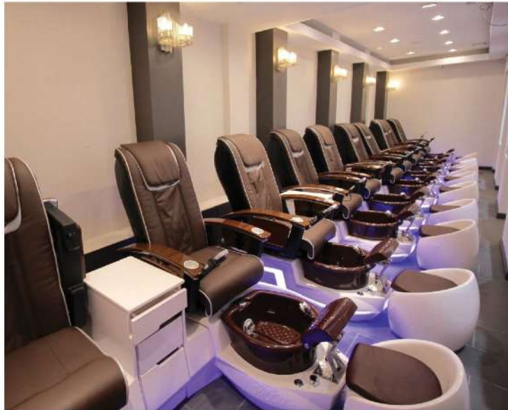
2200 sf Interior Buildout