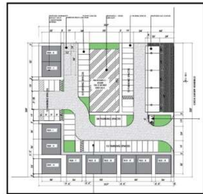
Ground up | Apartment Units | Conroe, TX General Contractor | 24 units Apr 2023 - Mar 2024