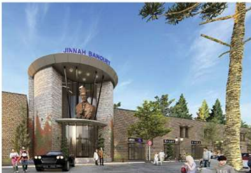
28000 sf Design & Build Dec 2022 -Mar 2026