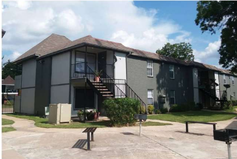
Demo & Rebuild | Apt Bldg | Houston, TX General Contractor | 8 units Bldg Jan 2020 - May 2020