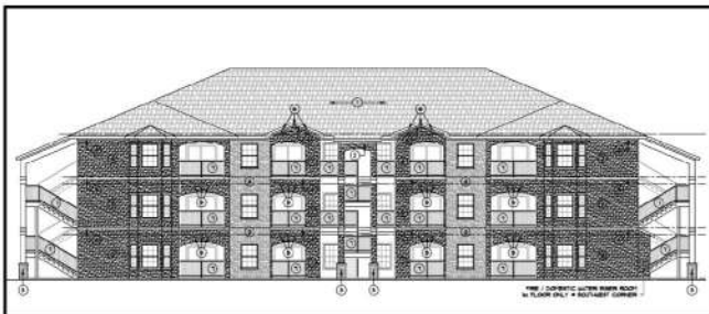
Ground up | Apartment Units | Conroe, TX General Contractor | 24 units Apr 2023 - Mar 2024