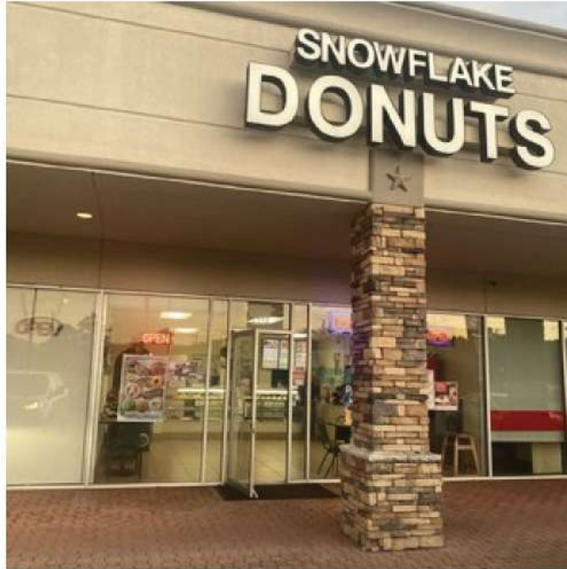
Interior Buildout | Restaurant/Cafe Sugar Land, TX General Contractor | 1800 sf Oct 2020 - Dec 2020